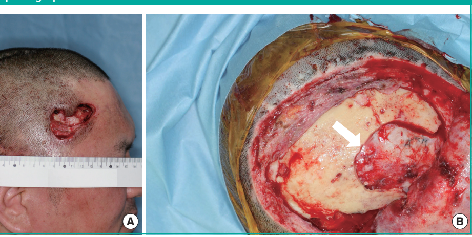
Fig. 2. Immediate postoperative photograph of case 3

(A) A 44-year-old male patient presented with soft tissue necrosis at the previous neurosurgical operation wound. (B) The wound contained soft tissue loss with the exposure of the underlying prosthetic dura (Neuro-Patch, white arrow) and dead bone.