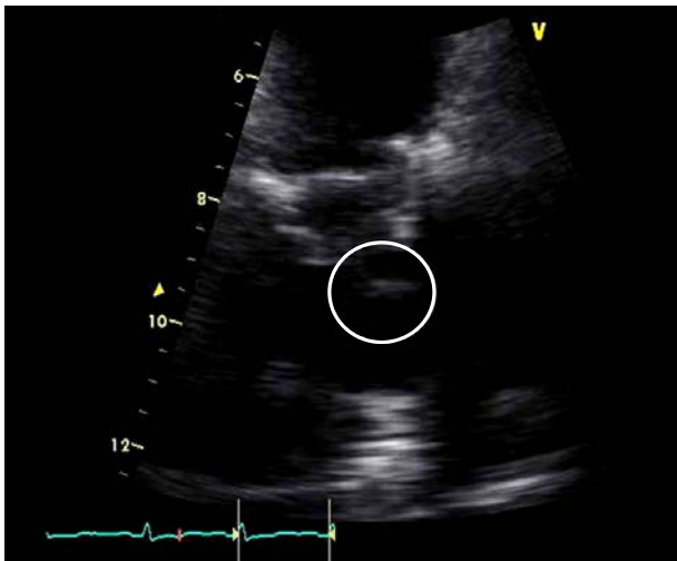
Fig. 1. The echocardiography showed a hypoechoic movable mass on the prosthetic pulmonary valve (circle).

Immediate postoperative echocardiography showed intact prosthetic pulmonary valvular function with a peak pulmonary valve pressure gradient of 34 mmHg and a mean pulmonary valve pressure gradient of 16 mmHg. Follow-up echocardiography was performed on postoperative day #19, and the peak pulmonary valve pressure gradient was 20.71 mmHg, while the mean pulmonary valve pressure gradient was 11.14 mmHg. No more microorganisms were isolated from his blood culture. The patient is currently being treated with anti-coagulant (coumadin), presenting no respiratory or cardiovascular symptoms during follow-up in outpatient clinic for 2 years after surgery. The last echocardiography was performed at 15 months after surgery; it showed intact prosthetic valve function with a peak pulmonary valve pressure gradient of 19 mmHg and a mean pulmonary valve pressure gradient of 10 mmHg.