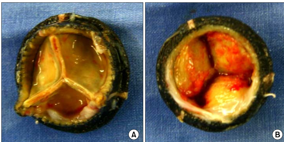
Fig. 2. (A, B) Removed prosthetic pulmonary valve. Vegetation can be seen on the valve leaflets (each side).

Prosthetic valve infective endocarditis is a serious and potentially fatal complication of valve replacement. According to the data by Arvay and Lengyel [1] published in 1988, prosthetic valve endocarditis developed in 19 of 329 patients