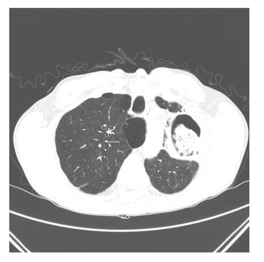
Figure 1 Preoperative chest computed tomography (CT) scan. A fungal ball with cicatrization atelectasis can be seen in the left upper lobe.