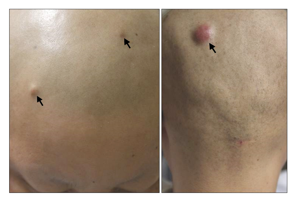
Fig. 1. Three 5 to 12-mm, flesh-toned to erythematous, firm nodules on the scalp (arrows).

Herein, we present the rare case of a patient with cutaneous metastasis of giant cell-rich osteosarcoma, which closely resembled a giant cell tumor. Owing to the different prognoses and treatment strategies for these tumors, it is important to ensure that the correct differential diag-