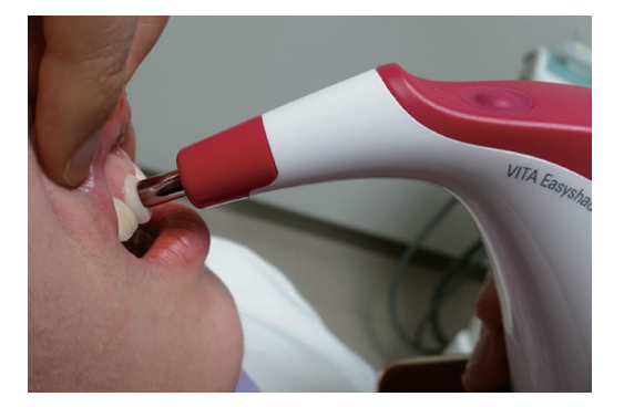
Fig. 1. The Easyshade V determined tooth color with the probe tip placing perpendicular to the tooth surface.

All measurements were performed by a single experienced operator. For every measurement, each device was conducted a white balance on its calibration block. The shade was measured at the central tooth area of labial surface<sup>8,15,17</sup> in "base shade determination" mode with the measuring tip lying flush on the tooth surface to achieve an accurate measurement (Fig. 1). The color measurements were carried out 3 times with an interval of 1 hour for each device.<sup>8,17,20</sup> Thus, a total of 270 readings per each device were obtained. The measurement results could be displayed in the VITA 3D-Master system, VITA classical shade system, VITABLOC shade, or bleach index. In this study, VITA 3D-Master system was used to analyze matching performance of the devices. Shade coordinates were also obtained by clicking 3D-Master shade. The degree of matching to shade guide system was indicated by a green (good), vellow (average), or red bar (adjust). In this study, only "good" matching results were used (Fig. 2).