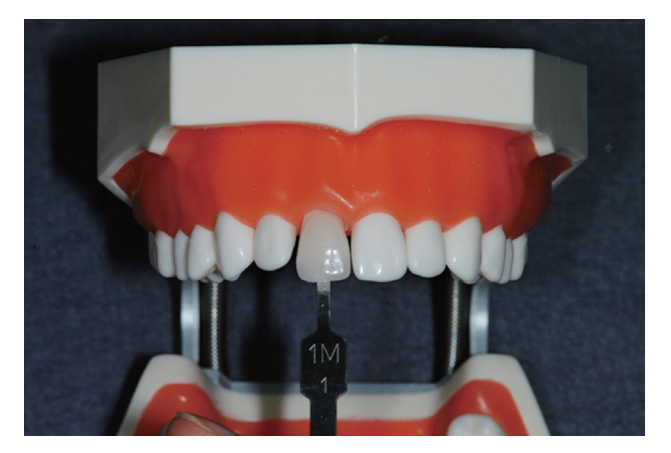
Fig. 3. Each shade tab to be measured was positioned in the dentiform model inside a black box.

To verify the measurement repeatability within devices, the intraclass correlation coefficient (ICC) and 1-way ANOVA followed by Bonferroni multiple comparison for L^* , a^* , and b^* values were analyzed. The ICC was obtained as an average measurement with absolute agreement and a 2-way mixed effect model. For matching reliability within devices, whether or not the obtained shade matched the correct 3D-Master shade tab, intra-device matching agreement rate was calculated.