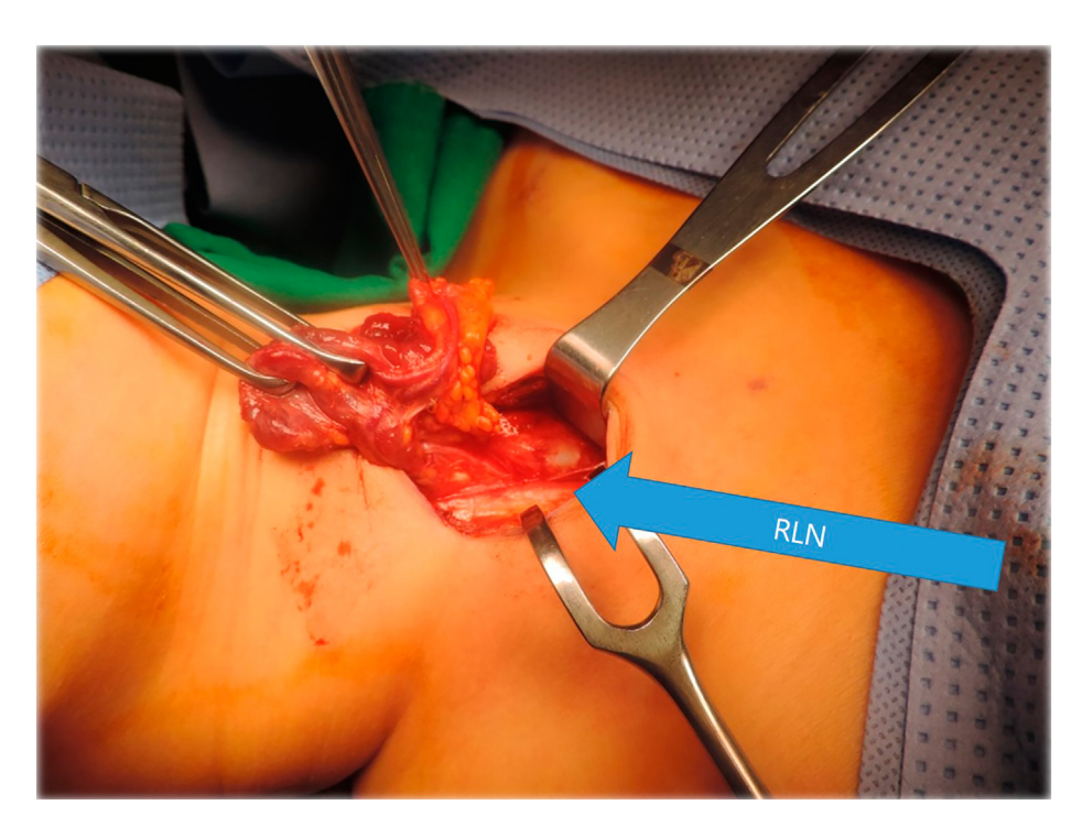
Fig. 2. When the upper pole of the thyroid gland is dissected, the whole thyroid gland can be removed out of the skin incision. A recurrent laryngeal nerve can be identified.