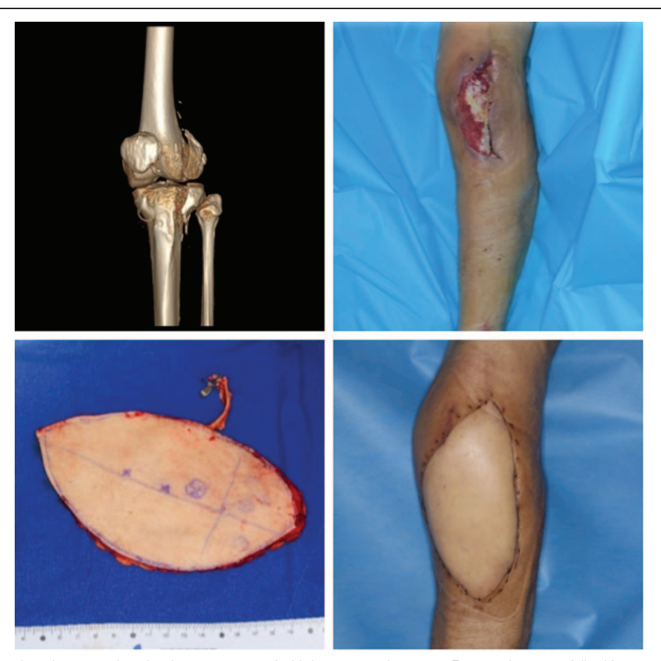
Figure 2. A 65-year-old male patient was referred to the trauma center for his lower extremity trauma. For open fractures of distal femur and proximal tibia with soft tissue defect, open reduction with internal fixation and ALT free flap transfer were performed by plastic surgeon and orthopedic surgeon.

While the role of plastic surgeons in the improvement of a person's appearance is well understood by the public and medical professionals, their role in acute trauma settings, with the probable exception of facial lacerations and facial bone fractures, is not as clear. This study clearly demonstrated that the scope of plastic surgery extends well beyond these boundaries. To a large extent, this is afforded by the training provided for both soft-tissue surgery and facial fracture surgery in programs with a strong reconstructive base. The tremendous flexibility of the plastic surgery specialty afforded by this training allows for overlap and interactions with other surgical specialties. This overlap can be capitalized on both by working in conjunction with other surgical services and through the use of plastic surgeons to cross cover other surgical specialties with a surgeon shortage.