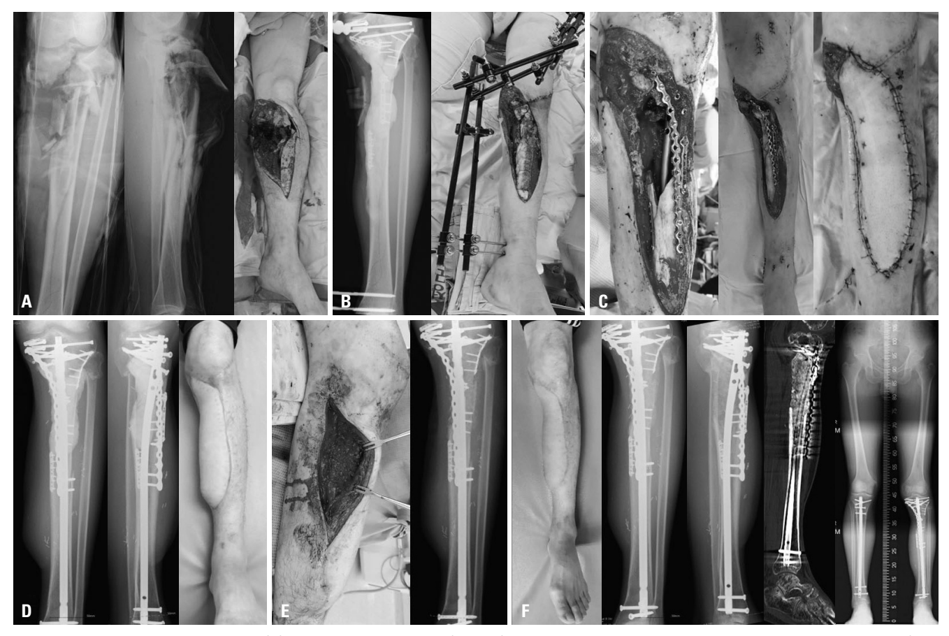
Fig. 1. Case of severe tibia open fracture. (A) A 46-year-old male patient (case 31) who sustained a severe comminuted proximal tibia open fracture (type IIIB) from a motorcycle traffic accident. (B) External fixation was performed with reductional plating using small plates and cannulated screws, and the bone defect was filled with a cement spacer on the day of injury. (C) Fix and flap surgery was performed 2 weeks later (conversional internal fixation with nailing and additional plating, cement spacer changing, and an anterolateral thigh free flap). (D) Postoperative 3-month follow-up X-ray showing adequate alignment and clinical photo showing satisfactorily healed soft tissue. (E) Cement removal and autogenous bone graft mixed with demineralized bone matrix and immediate postoperative X-ray. (F) A clinical photo shows the full recovery of the soft-tissue 9 months later. Postoperative follow-up X-ray and computed tomography scans show bone union.

ture concentrated in the proximal or distal part, plating was performed (Fig. 2). Reconstruction was performed by a microsurgery specialist, and either a free or rotation flap was selected according to the condition of the soft tissue around the fracture, age of the patient, and general condition.<sup>12</sup> When the condition of the reconstructed soft tissue improved, the patients were asked to begin joint range, quadriceps femoris muscle strengthening, and straight leg raise exercises. Initiation of weight-bearing exercise was dependent on the type of fixator used. When nailing was performed for fixation, immediate full weight-bearing exercise was allowed if the patient could tolerate this. In the case of fixation with plating, partial weight-bearing exercise was allowed when pain disappeared, while full weight-bearing exercise was allowed 6 weeks after surgery.<sup>13</sup> The patients were allowed to return to daily life after discharge from the hospital for outpatient follow-up if they had no fever, if the flap site was viable without redness, swelling, or flush at the surgical site, and if there was no evidence of infection, such as a sudden rise in Creactive protein levels or white blood cell count.14