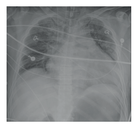
Fig. 1. Chest radiography on admission. Chest radiography showed marked cardiomegaly with pulmonary congestion. Although thoracotomy scar was present on the right anterior chest wall, chest radiography demonstrated no evidence of previous cardiac surgery including midline sternotomy wires or mediastinal surgical clips.

He was eventually identified and found to have undergone a robotically assisted minimally invasive mitral annuloplasty.