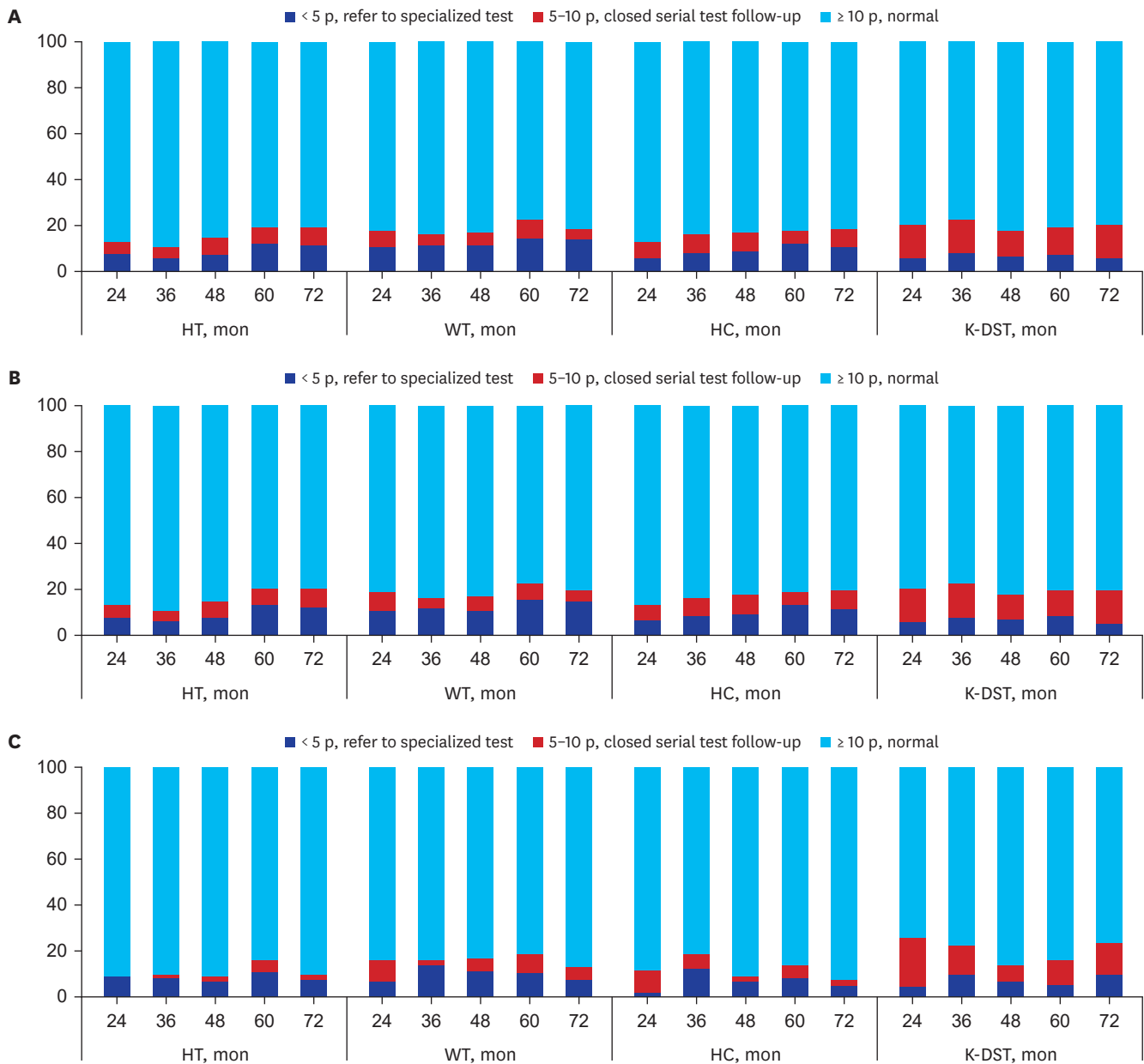
Fig. 3. Growth and developmental outcome of infants between 24 and 72 months, who were born in 2013 and diagnosed congenital gastrointestinal anomalies with an operation (A), congenital digestive anomalies with an operation (B), congenital abdominal wall defects with an operation (C). HT = height, WT = weight, HC = head circumference, K-DST = Korean Developmental Screening Test.

to incidences for EUROCAT. Additionally, we discovered that 6.7% died, 16.7% had poor weight growth, and 23% had developmental delay, which was investigated from follow-up examinations until 72 months of age.