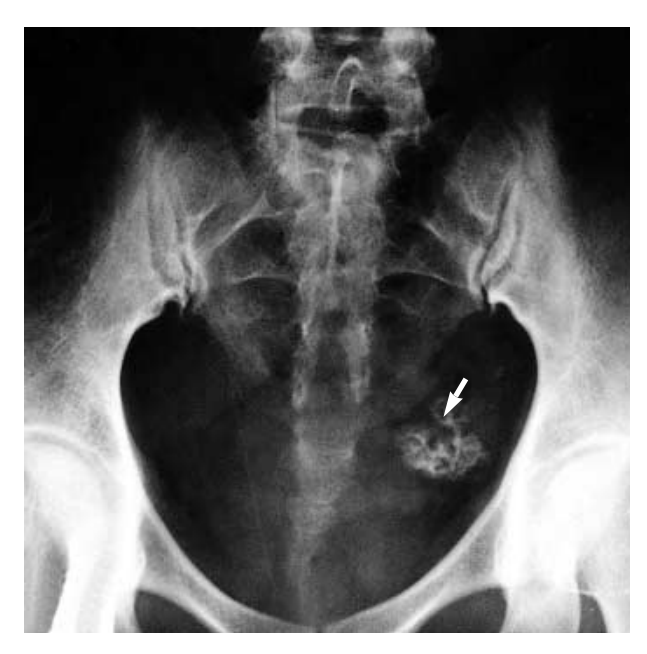
Fig. 1. The pelvic radiograph reveals well-defined ovoid mass with curvilinear calcification.

of underlying bone. The common pattern of calcification is curvilinear with ring like densities that outline the soft tissue lobules. Our case also demonstrated these radiologic appearances. Grossly, these tumors are well circumscribed, often encapsulated and have a glassy, myxoid or calcified cut surface. They are usually small, measuring less than 3 cm in diameter. On the light microscopic findings, most tumors are composed of mature hyaline cartilage, often showing foci