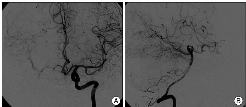
Fig. 3. Follow-up angiography at the time of discharge reveals good collateral circulation from the ipsilateral posterior communicating artery and anterior communicating artery in both the anteroposterior (A) and lateral views (B).