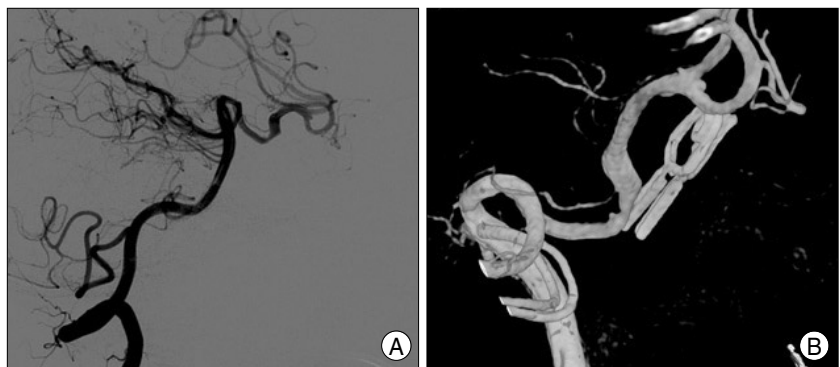
Fig. 4. One year follow-up angiography. Lateral view (A) and 3-dimensional rotation view (B). Ipsilateral posterior communicating artery is thicker in diameter, which shows better collateral circulation.

an identifiable neck and are known to be one of the most difficult lesions to treat. They are fragile and can rupture during microsurgery. It also can cause postoperative rebleeding more frequently than saccular aneurysms 2,12 . The natural history of the BBA has not been clarified because this type of lesion is rare. Although several surgical strategies are available to treat BBAs, the safest treatment modality is still a matter of conjecture.