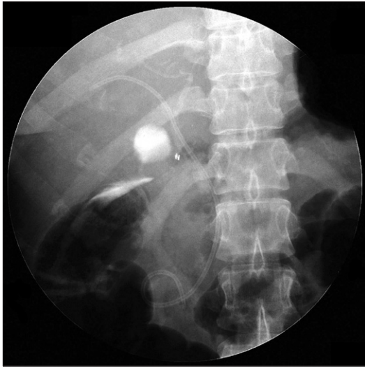
Fig. 2. Fluoroscopic image showing a double-pigtail stent in place after endoscopic sphincterotomy.