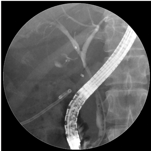
Fig. 3. Cholangiogram showing persistent leakage from the same site and a pigtail catheter for evacuating the peritoneal fluid.

bile leakage, revealing bile leaking through the right hepatic duct from the disrupted duct of Luschka at the liver bed into the subhepatic space where the gallbladder originally existed (Fig. 1). A 7-Fr, 10-cm double pigtail plastic stent was placed in the bile duct after endoscopic sphincterotomy (Fig. 2), and the patient was given a broad-spectrum antibiotic and observed. She continued to have a high fever reaching 39.5°C with a rising C-reactive protein. An abdominal CT performed 2 days after ERCP showed an increased amount of fluid collection in the abdominal cavity. The abdomen was distended and diffusely tender upon abdominal palpation. Although two percutaneous drainage catheters were inserted to drain the fluid from the abdominal cavity, the symptoms worsened. A second ERCP revealed continued bile leakage from the same site (Fig. 3).