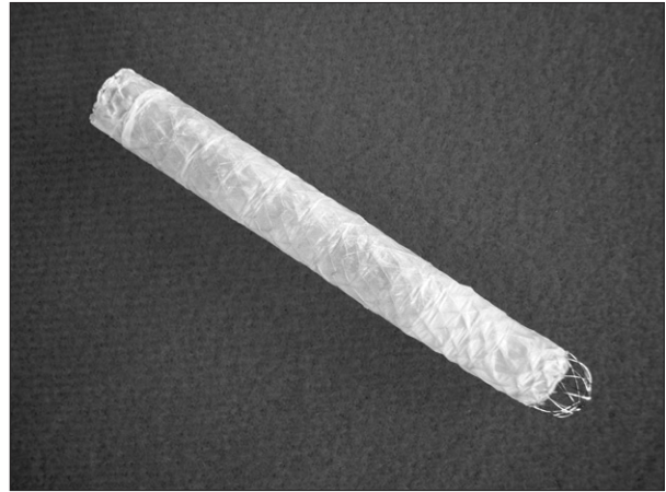
Fig. 4. A retrievable polytetrafluoroethylene-covered, self-expandable metal stent with a ball-tipped distal end.

We decided to use a FC-SEMS for the treatment of the sus-