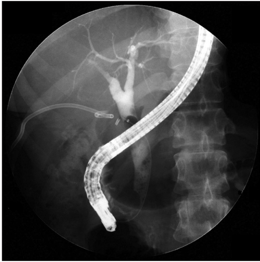
Fig. 6. Cholangiogram after removal of the stents showing closure of the leak.

scopic guidance, and the stent was successfully removed without any complications. Following that, the plastic stent in the left intrahepatic bile duct was also removed. A cholangiogram revealed successful closure of the bile leakage from the duct of Luschka (Fig. 6). She remained well with no biliary symptoms at the 5-month follow-up.