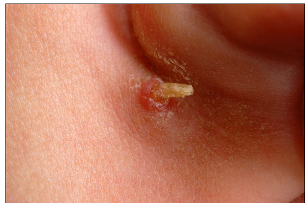
Fig. 1. Hyperkeratotic projection on the umbilicated papule in the posterior auricular area.

MC presenting as a cutaneous horn has previously been reported as a penile horn in two adults and as a solitary firm horn-like projection on the left upper eyelid in one child. They all were HIV-positive 3-5 . This is an interesting case of MC presenting as a cutaneous horn in an immunocompetent patient. Therefore in an effort to establish an early diagnosis of MC, clinicians should be aware of