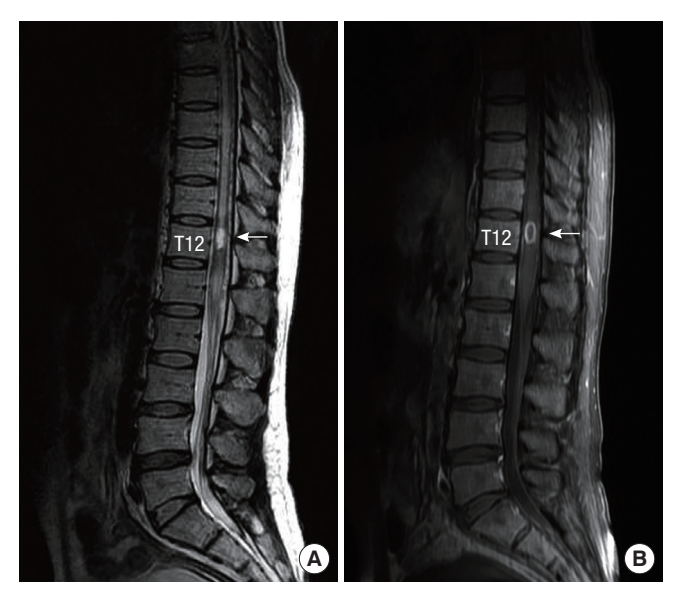
Fig. 2. Pre-operative T2-weighted and gadolinium enhanced T1-weighted lumbar MRI in the patient. (A) A T2-weighted MRI revealed increased T2 signal intensity (arrow) on T12 level and extensive edematous infiltration on intramedullary space. (B) Mass lesion (arrow) showed significant rim enhancement after gadolinium based contrast agent injection.