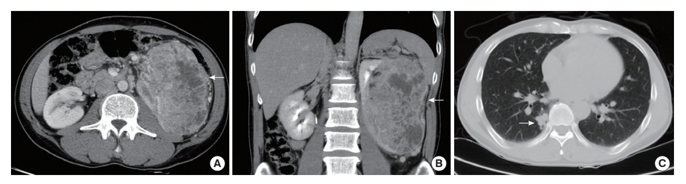
Fig. 1. Initial CT images of the patient. (A and B) Abdominal CT revealed a left renal cell carcinoma (arrow). (C) CT scan also revealed nodular metastasis on lung field (arrow).